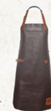
LS 23/17 mocha