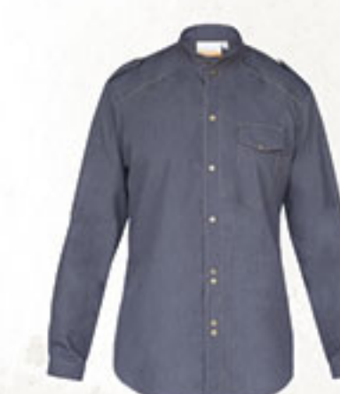
JM 28/16 vintage black