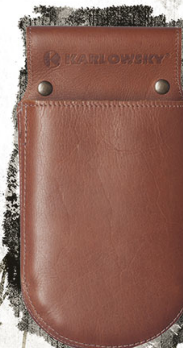
KZB 39/18 cognac