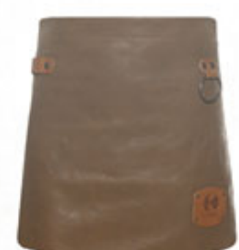
VS 8/46 toffee