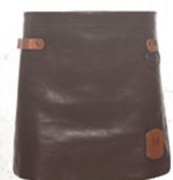
VS 8/17 mocha