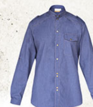
JM 28/15 vintage blue