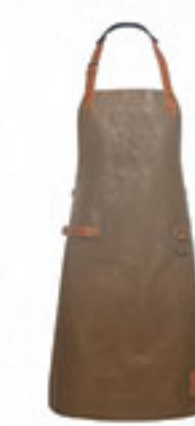
LS 23/46 toffee