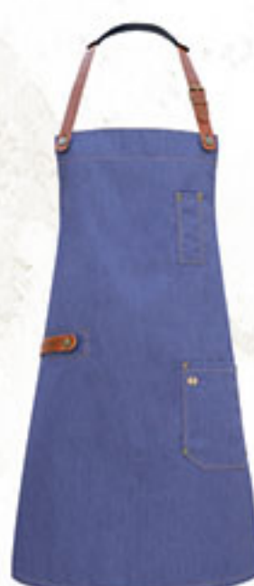
LS 24/15 vintage blue