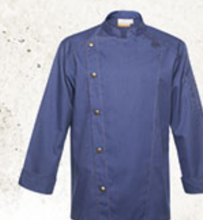
JM 24/15 vintage blue