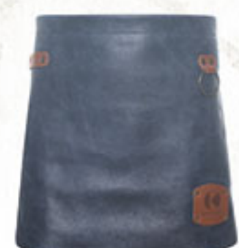
VS 8/36 ink