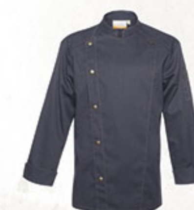
JM 24/16 vintage black