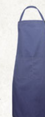
LS 22/15 vintage blue