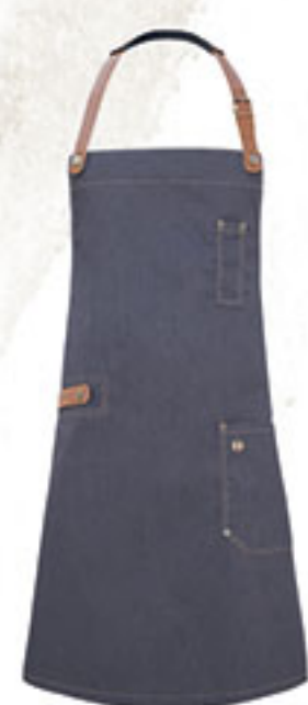
LS 24/16 vintage black