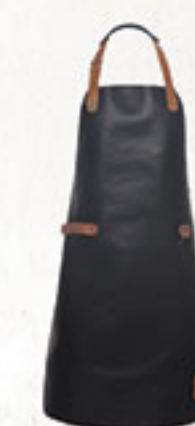
LS 23/1 black