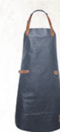
LS 23/36 ink