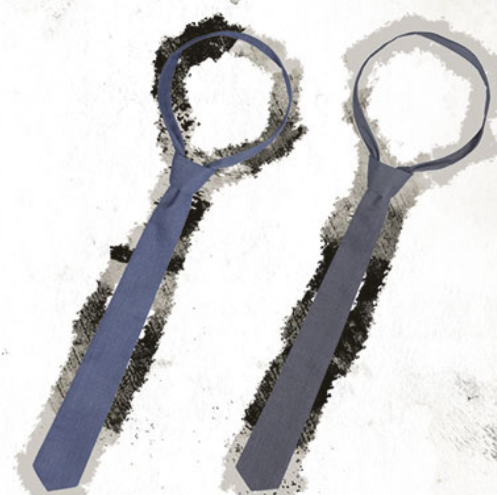
AK 12/15 vintage blue