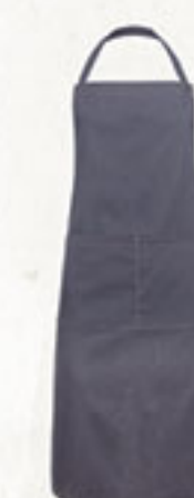
LS 22/16 vintage black