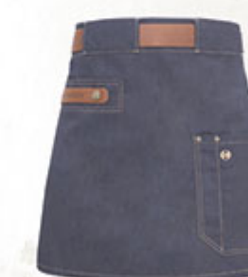
VS 9/16 vintage black