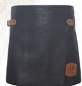
VS 8/1 black