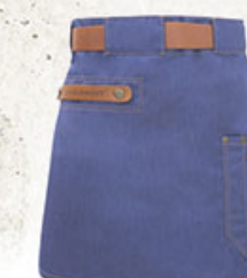
VS 9/15 vintage blue