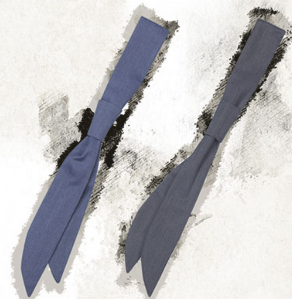
AK 11/15 vintage blue