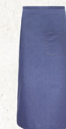
BSS 9/15 vintage blue