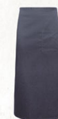
BSS 9/16 vintage black